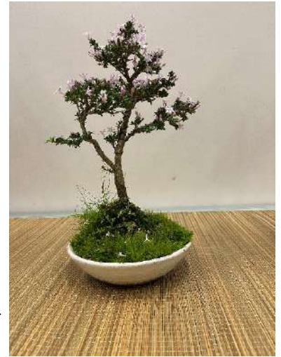
Bryan's Cassia in flower

Presenting trees with the concrete pot from the demonstration last month in the foreground