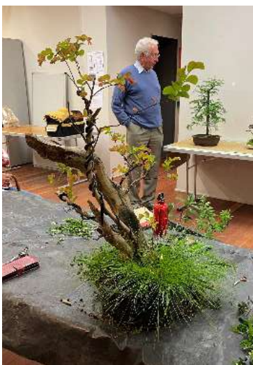
Bryan's interesting Crepe Myrtle