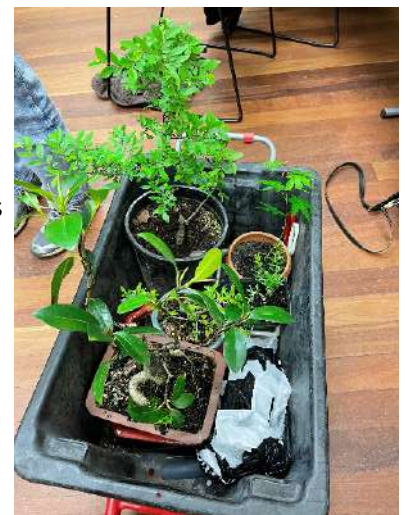
Gracie's collection of WIPs