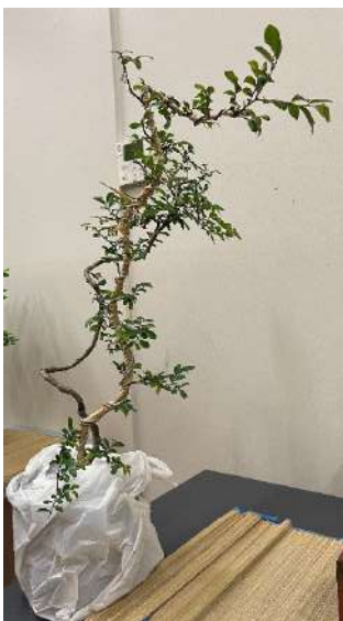
Frank's Olive showing a lot of movement