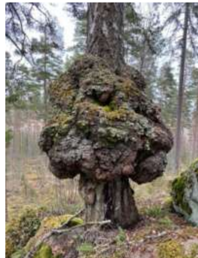
Serious Nebari – or is it taper?

We always welcome any contributions from members, so if you have a project underway, have a query, want to sell/swap/buy something, or otherwise have a tale to share, please get in contact via info@sydneycitybonsai.org.au or one of the Committee members.