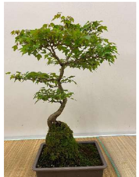
John's? Maple showing good