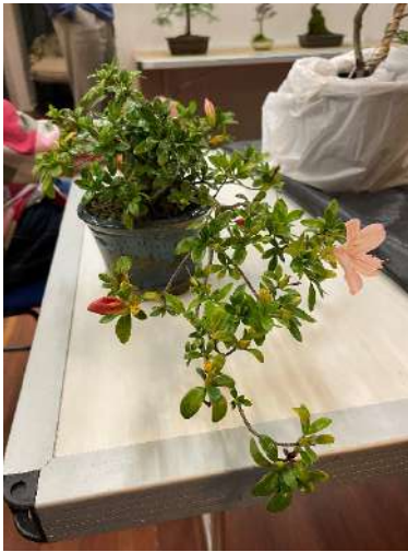
Simon's Azalea in flower