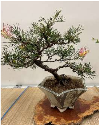
Neville's Grevillia in flower