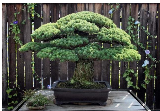
I wish this was in my backyard

We always welcome any contributions from members, so if you have a project underway, have a query, want to sell/swap/buy something, or otherwise have a tale to share, please get in contact via info@sydneycitybonsai.org.au or one of the Committee members.