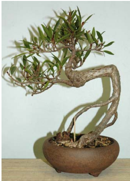
Ficus 'Little Ruby' Miniature bonsai