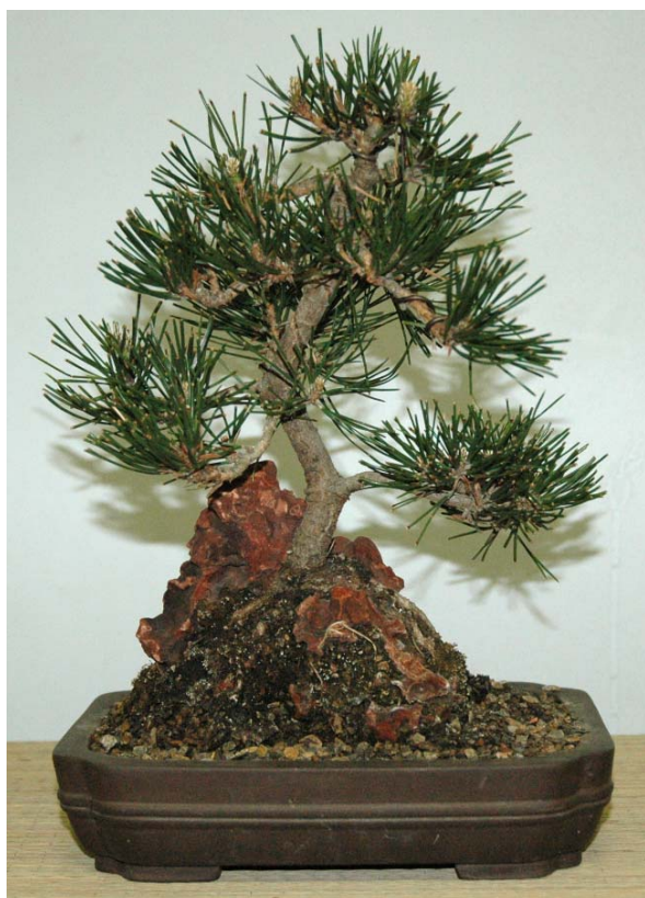
Doug's Black Pine miniature bonsai