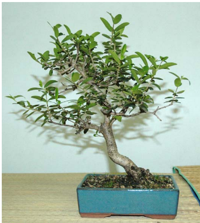
Peter's Privet bonsai