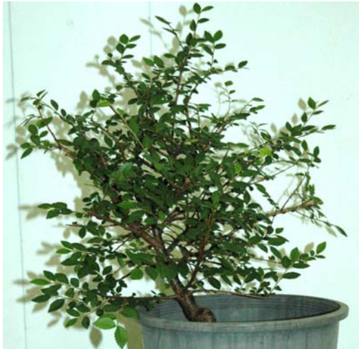
Sophie's Elm before