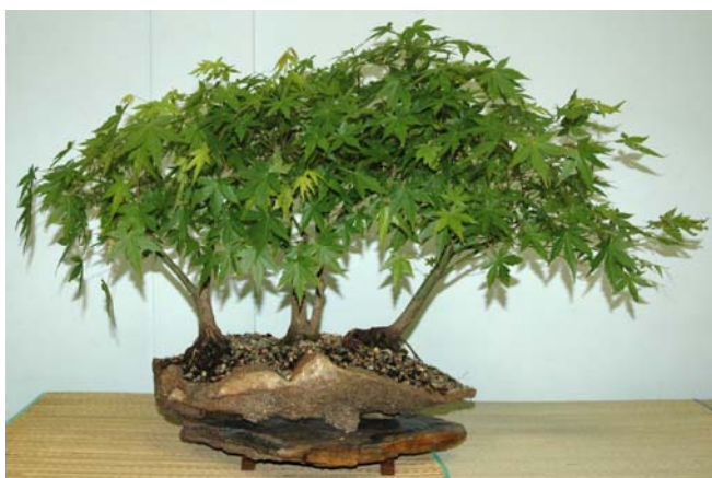
Acer palmatum , Japanese Maple group planting