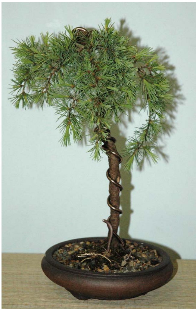
Cedrus deodara 'Mountain Beauty' a beautiful & rare form of Cedar