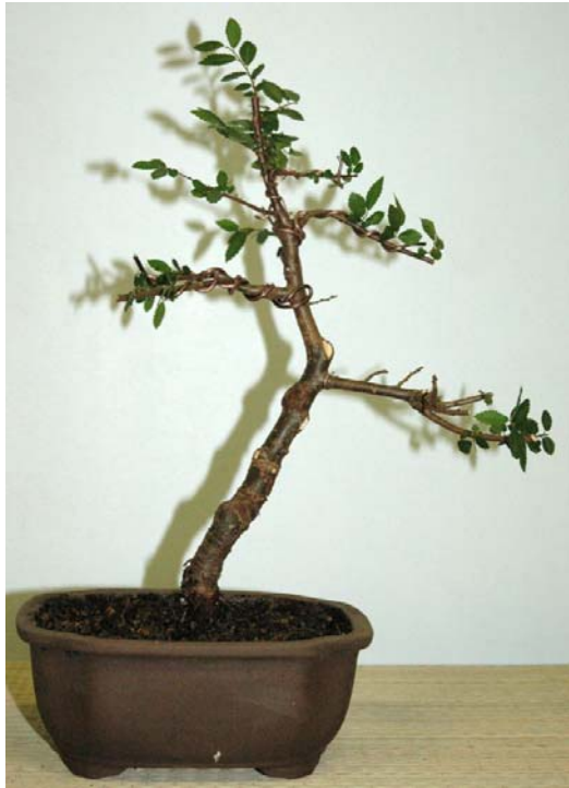
Sophie's Elm after