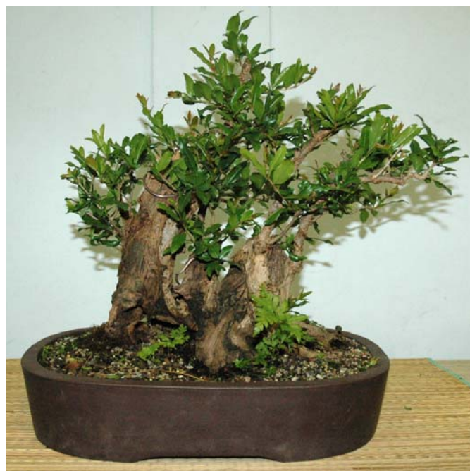
Punica granatum 'Nana' – Miniature Pomegranate bonsai