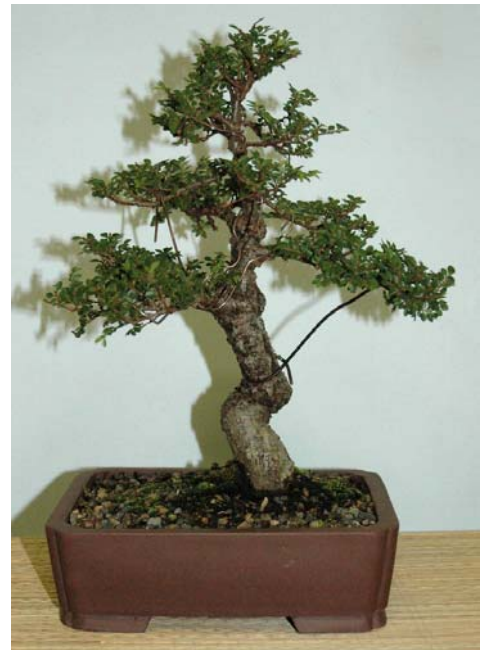
Informal upright Elm bonsai