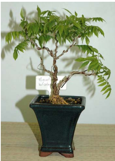
Miniature Wisteria bonsai