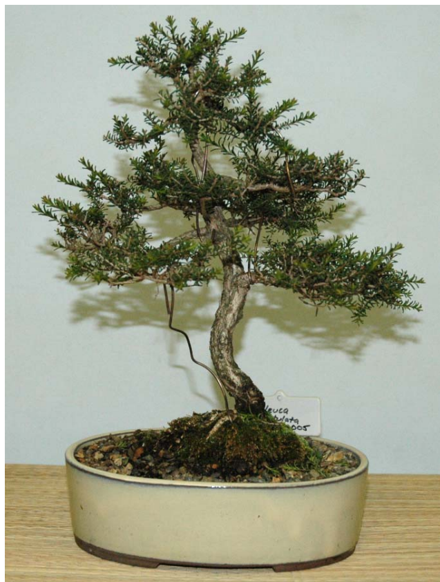
Sue's Melaleuca pustulata bonsai – this is an uncommon species from Tasmania