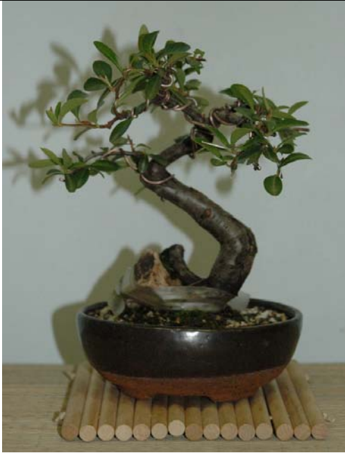
Pyracantha Miniature bonsai