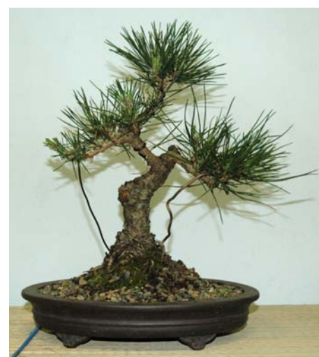
Doug's Black Pine Miniature bonsai