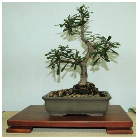
Neville's Banksia integrifolia bonsai