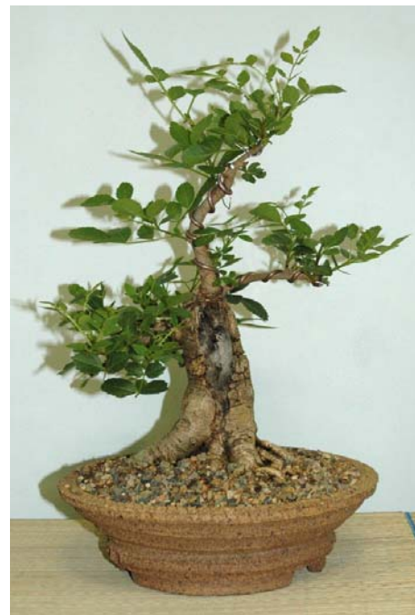
Fraxinus angustifolia Desert Ash bonsai