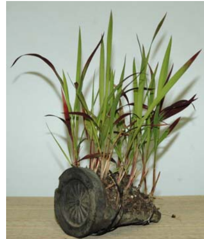
Doug's creative companion planting of Fire Grass in a Japanese roof tile