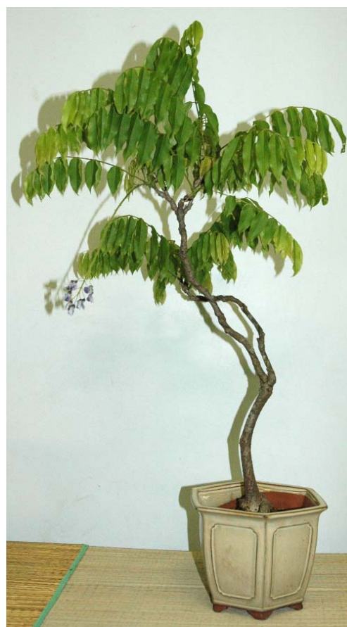
Wisteria floribunda – Japanese Wisteria bonsai

...a bonsai truly represents the fusion of nature and human wisdom; it is an art that at once pursues the spirits of both nature and beauty.