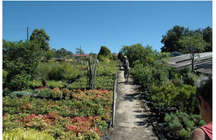
General View of Riverview Nursery

We were 11 on the Nursery Crawl on February 23; the day was sunny and hot. Riverview Nursery was our first stop. The nursery has a lot of old stock that is not great for general garden culture but offers some excellent opportunities for the bonsai artist.