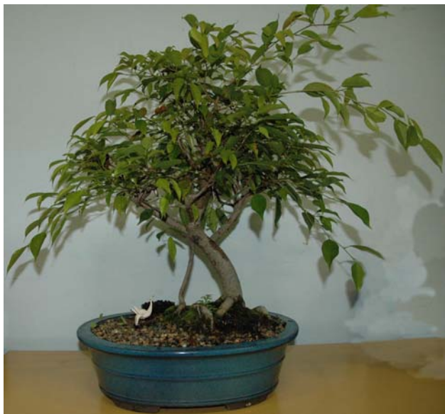
Brian Everts' Ficus benjamina bonsai