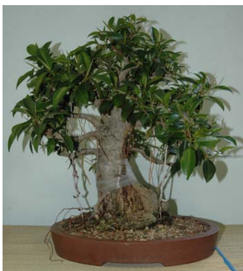
Neville Althaus's Ficus rubiginosa bonsai