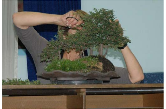
A final snip and the pruning of the group planting is complete