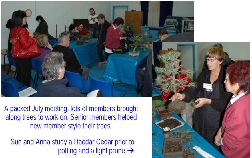
A packed July meeting, lots of members brought along trees to work on. Senior members helped new member style their trees.