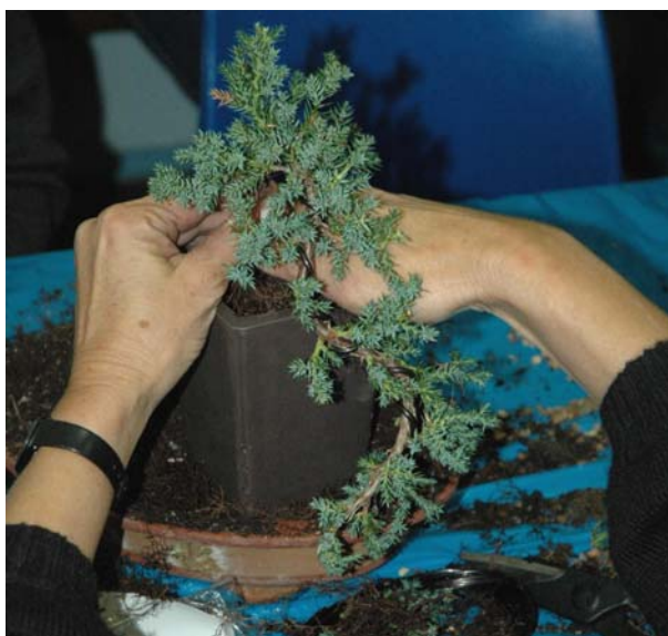
The Juniper being placed in tall pot by Sue