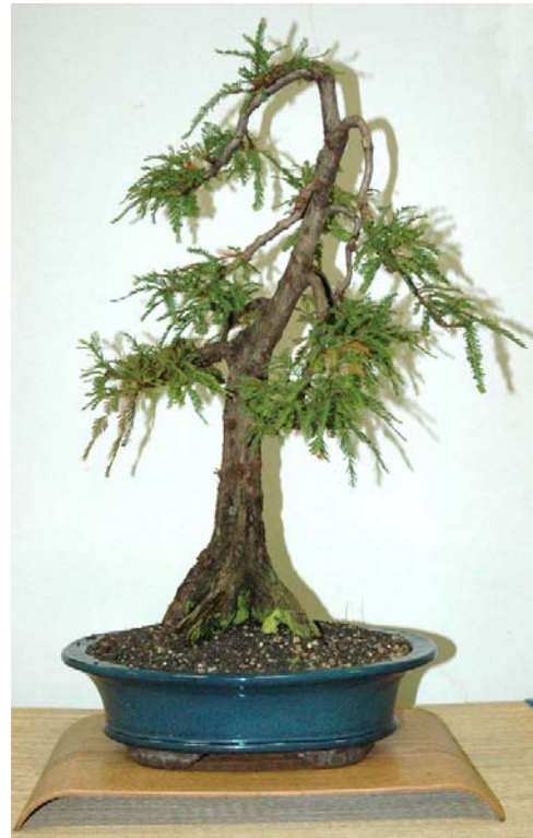
Neville's Taxodium bonsai