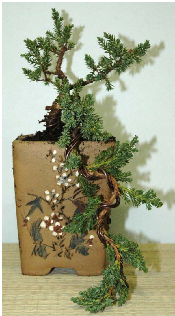
Aaron's Juniper after re-styling