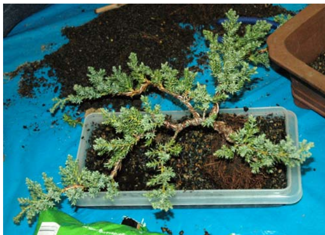
Aaron's Juniper ready for styling