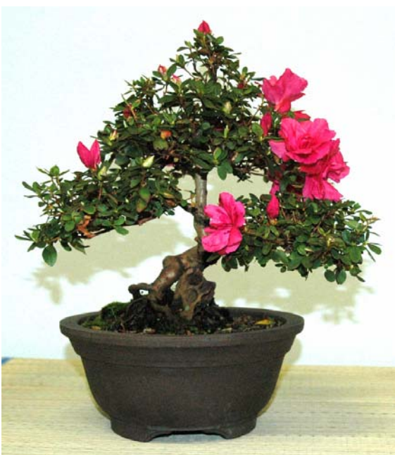
← Sue's Azalea bonsai