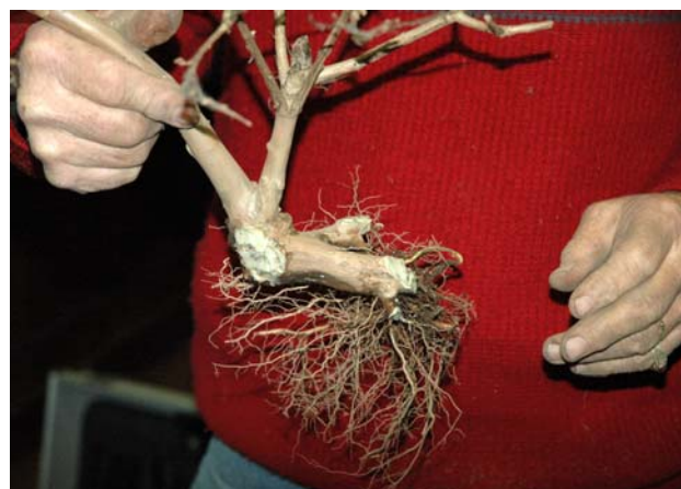
The end result of the initial pruning