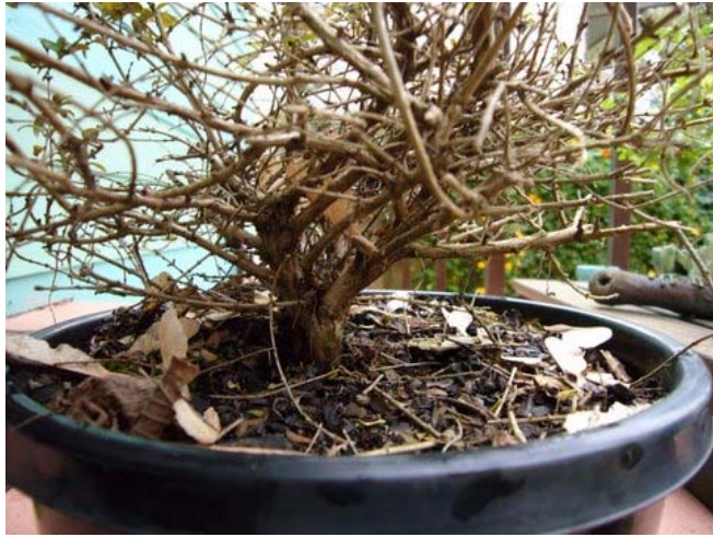
Honeysuckle in April 2007 before initial styling

What a difference 15 months makes! Members might remember the old nursery stock of Lonicera nitida – Box Leaf Honeysuckle that Tony donated to the club.