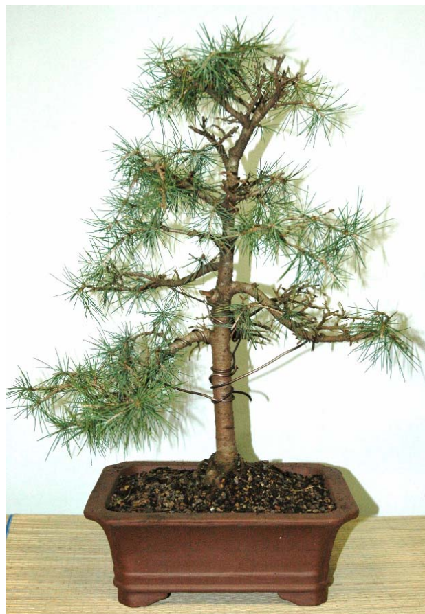
Anna's Deodar Cedar after potting up