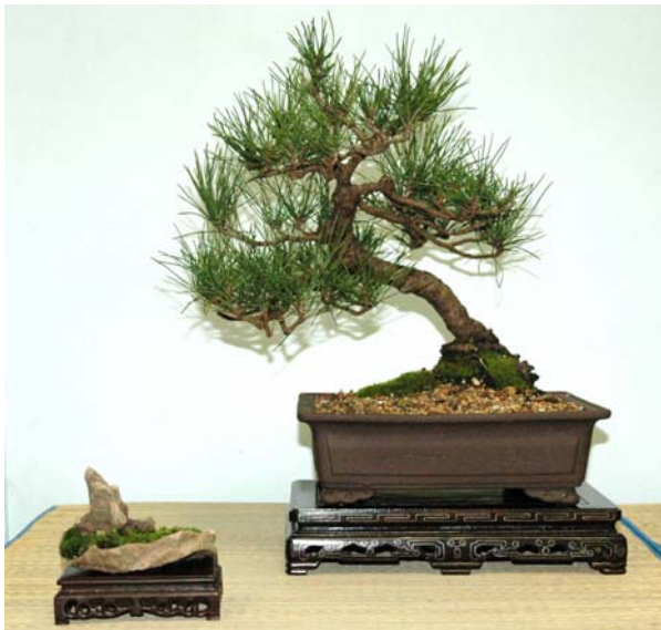
Doug's Pinus thunbergii - Black Pine bonsai & companion plant