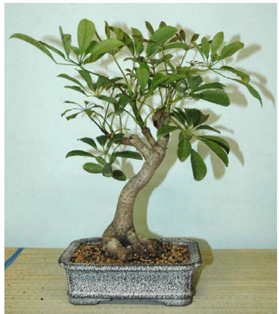
Hector's Umbrella Tree bonsai