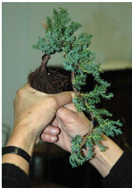
The same Juniper after Sue did some subtle pruning and wiring