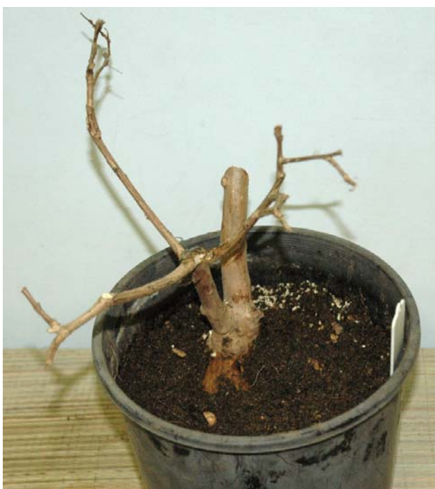
Paul's Crepe Myrtle potted up in a training pot