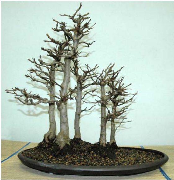
Sue's Liquidambar group planting