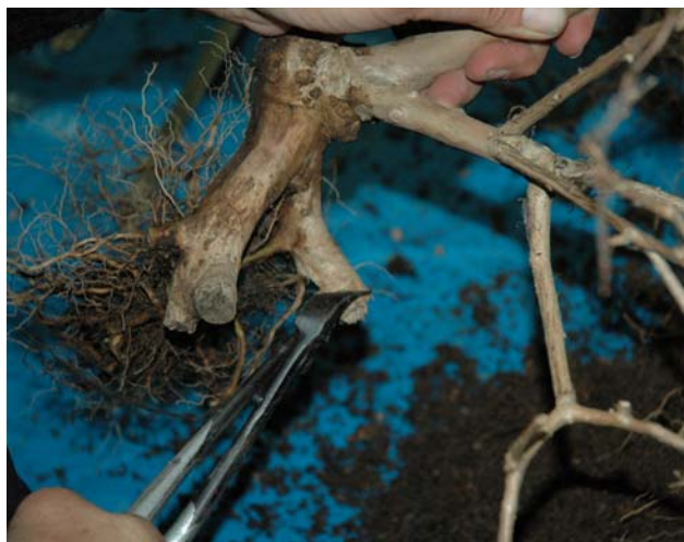
Paul pruning away dead parts of the trunk to improve the lines of the tree