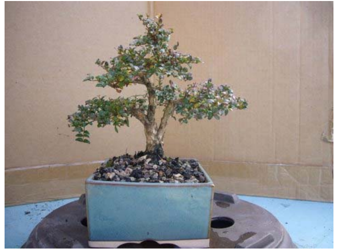
Honeysuckle in July 2008 potted up into his first bonsai pot