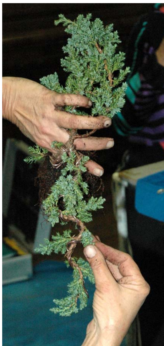
Another cascade Juniper in the making